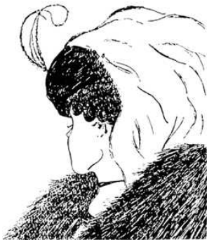
Old or Young Woman?